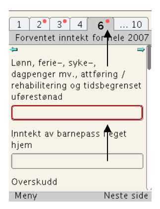
Figure 2. Changes in the colour scheme indicate invalid or incomplete input. Red •-marks on the tabs 2, 3 and 6 indicate that these tabs contain invalid or incomplete input fields or multiple choices. The strong frame on the active tab is red as well, indicating which input field needs to be completed.