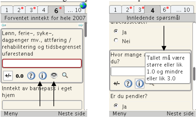
Figure 5. In the current version of the Mobile Tax Demonstrator, audio output is connected to help information (loud speaker icon). Additional help is available through the question mark icon.

errors and to help the user out of trouble we have implemented two help functionalities in the Mobile Tax Demonstrator. One is voice-based help. Research shows that there is a clear connection between multimodal UI design and accessibility (Obrenovic et al., 2007). In our demonstrator, help texts connected to an input field can be read aloud by choosing the audio icon (Figure 5). Moreover, if the user stops to proceed, a slowly blinking question mark appears on the screen. Behind this icon, additional information is available (such as formatting information and the like). In this context it seems appropriate to mention that the appearance of icons can be modified according to any convention or preference.