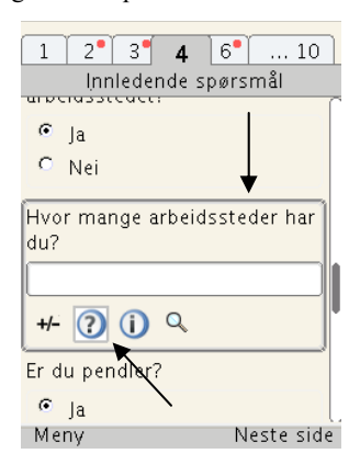
Figure 3. Active working area and active help-icon are accentuated by a focal frame.