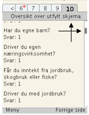
Figure 1. Task tabs and marking of the active tab (no. 10 which in this case is the final tab showing all input that the user has given). Scroll-bar showing the relative position on the right.

The input-output techniques deserve a good deal of attention. In connection with input or output users often arrive in error situations. In order to avoid some of these we have implemented a colour scheme that indicates invalid or incomplete input. The colour scheme changes when the (sub)task is completed. Before completion a field or a tab is identified in a colour that differs from the ordinary colour scheme of the design. This mechanism also ensures the quality of input data (Figure 2). In Figure 2, the mark-out concerns mandatory income information. The colour scheme is connected to the definition of a so-called 'skin', i.e. the colour palette for the UI. This can be freely modified according to user requirements or preferences.